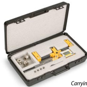
Carrying case available.

Dillon also manufactures highly accurate tensiometers, mechanical dynamometers and crane scales.